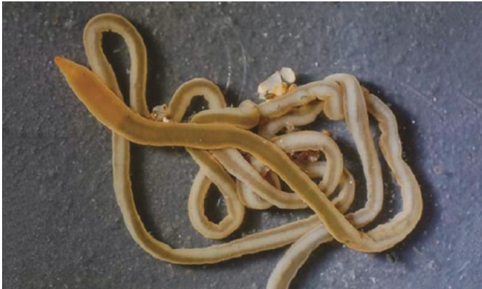
Mature male of Cephalothrix simula.

Cephalothrix simula is a nemertean worm and is an invasive, non-native, ‘highly toxic’, species of ribbon worm. Commonly called the Pacific Death Worm, it has only physically been found in the UK at two sites, one in Cornwall and one in Dorset. Its presence in Southampton Water is only known from eDNA analysis. Do not be concerned by the name this worm currently poses little to no threat to health or the economy.