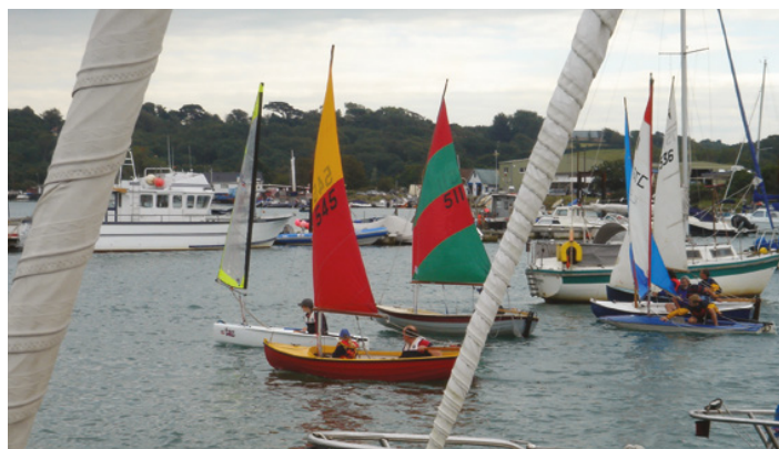
Bembridge Harbour watersports

The Bembridge and St Helens area has much of interest to the naturalist. The harbour is a Ramsar Site and the immediate area lies within the Solent European Marine Sites conservation zone. The recently designated Bembridge MCZ (Marine Conservation Zone) covers the offshore coastal area and is considered one of the most biologically diverse marine reserves in the country. The RSPB Brading Marshes Reserve has been under a major management programme for some years to create and maintain the area primarily for waders. The proximity of the relatively peaceful and organically rich mudflats, combined with the careful management of the invertebrates and water levels on the marsh, has provided an important habitat for overwintering and breeding waders. Bitterns were heard booming in the reedbeds last year and are believed to have bred this year, and a recently released white tailed eagle (sea eagle) was photographed on the marsh at the end of August.