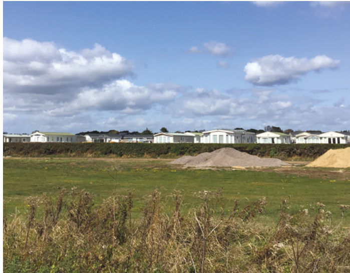
Development at the southern edge of Milford taken on the road from Hurst Spit.

The local planning authorities bordering the Solent are publishing development policies designed to meet government set targets for the construction of new homes for the years ahead. At first sight this seems an unlikely topic for the Solent Protection Society to dwell upon but it is of relevance to anyone interested in the future of the region.