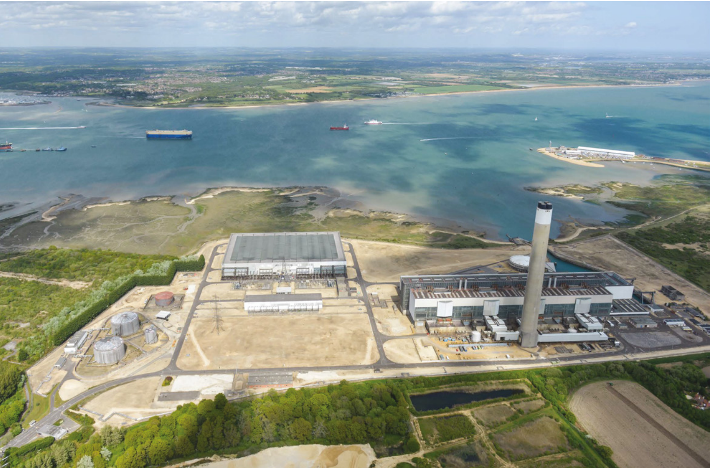
View of the site from the west

In the Autumn 2018 issue of the Society's Newsletter we reported on the proposal to build a new town at Fawley on Southampton Water. This article is an update of developments since then. This is perhaps the most important development on the shores of the Solent this century and as such it is receiving close scrutiny from the Solent Protection Society (SPS). The new small town would be built on the site of the Fawley Power Station, which was closed in 2013. This is a brown field site but it is surrounded by the New Forest National Park and a small part of the scheme would be on National Park land.