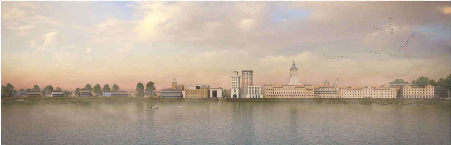
Illustrative view of Fawley Waterside across Southampton Water