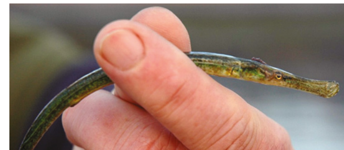
Deep-snouted pipefish caught in Stanswood Bay Zostera bed.

Zostera beds are species-rich, particularly the subtidal beds of Z. marina . A large number of algal species occur as epiphytes on Zostera leaves (some species are found only in eelgrass beds). Other algae grow amongst the eelgrass or as mats on the sediment surface. Eelgrass offers an attractive and protective habitat for small animals including many crustaceans and fish. For example, in Solent seagrass beds you can find deep-snouted pipefish, seahorse and fifteen-spined stickleback. There are also plentiful prawns and cuttlefish. When an area has healthy seagrass beds it is almost certain that it will hold plentiful marine life. Zostera spp. is also an important food for wildfowl including the dark bellied brent goose and wigeon which feed on intertidal beds.