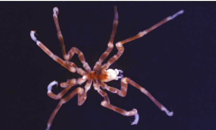
The pycgonid or sea spider Ammothea hilgendorfi

Plankton has been monitored in Southampton Water for some years and recently noted surprising numbers of two invasive species which would not normally be considered members of the plankton. The first is the North Pacific pycgonid or sea spider, Ammothea hilgendorfi. This species cannot swim so it is surprising that at some times of the year they appear in the water column.