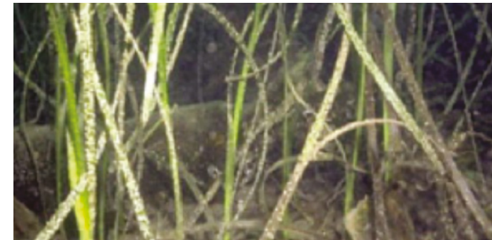
Eelgrass underwater.

I can still remember as a young teenager my amazement when told that there were flowering plants living completely submerged in the sea. Our sea grasses or eelgrasses, Zostera spp, form an important inshore plant community in the Solent and surrounding areas. There are 3 eelgrass species in British waters and all are considered vulnerable and in need of protection and all live in the Solent. There are large eelgrass beds along the north coast of the Isle of Wight, Langstone, Portsmouth and Chichester Harbours and in Stanswood Bay, near Calshot, intertidal beds are easily seen. Leaves shoot from a creeping rhizome system that binds and stabilises the seabed sediment reducing coastal erosion. Leaves and rhizomes contain air spaces that aid buoyancy. Eelgrass have separate male and female flowers on the same flower head. It usually flowers in late summer, dispersing thread-like pollen grains into the sea. Z. marina beds develop on firm sand, sometimes mixed sediments and usually grow below the low water spring tidal limit. Patches have been found in the Solent including to the west of Needs Ore, between Newtown and Gurnard Point, and to the east of the mouth of the Medina River on the north coast of the Isle of Wight (Tubbs, 1999). The Hampshire and Isle of Wight Wildlife Trust have been running the Solent Seagrass Project to gather information on the extent of seagrass beds in the Solent area.