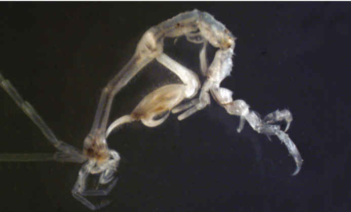
Japanese skeleton shrimp, Caprella mutica, image © P. A. Henderson

The second is the Japanese skeleton shrimp, Caprella mutica . This is also a non-swimming species which is surprisingly common in the water column possibly when reproducing or dispersing to new habitat. It was first reported in Europe in the Netherlands in 1994 now widely distributed in British waters. These are truly odd-looking animals, the head is at the right of the picture.