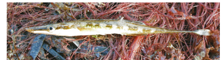
15-spined stickleback caught at Calshot.

Although seagrass beds are critically important habitats that support human well-being the extent of the beds throughout the world are declining at a rapid rate. Within British waters the decline in extent and well-being of seagrasses is linked to pollution from industrial effluents and sewage, mechanical disturbance, land reclamation etc. Zostera marina is susceptible to a wasting disease caused by a slime mould. In the 1930s populations were decimated by this disease and some have never fully recovered. Zostera angustifolia and Zostera marina are both affected by nutrient enrichment from nitrates, oil pollution and anti-fouling paints used on boats.