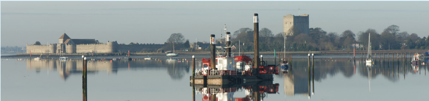
Portchester Castle from Port Solent