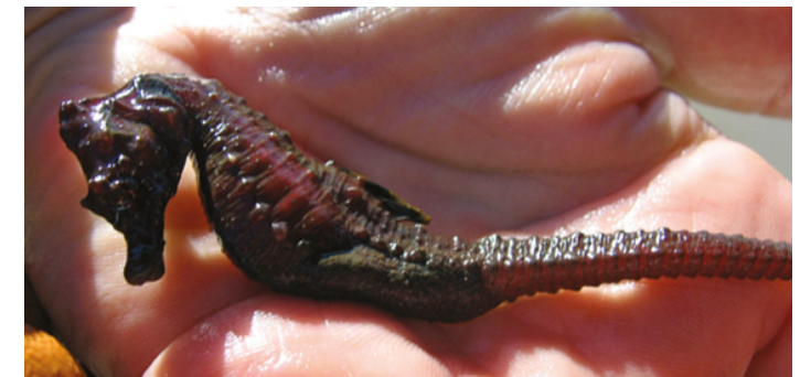
Short-snouted seahorse captured in Southampton Water