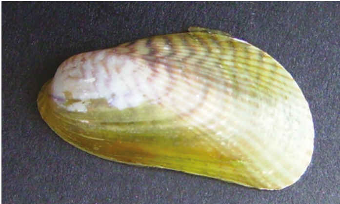
Musculista senhousia (Asian mussel)

Arcuatula senhousia (Asian date mussel) This mussel is a native of the Pacific Ocean from Siberia to Singapore, but has invaded many other regions of the world. It can live in the intertidal or shallow subtidal zones. It grows quickly and lives for only about 2 years. It prefers soft substrates and surrounds its shell in a dense mass of byssus, the beard-like threads mussels use to attach to rocks etc. This species is considered detrimental to seagrass beds which are important in the Solent region (see article in this issue). In fact, shells had been spotted prior to 2018, but the presence of DNA indicates a living population is certainly in the Solent. Readers should look out for this mollusc when walking our beaches. Barfield et al (2018) reported shells of Asian date mussel on Solent beaches.